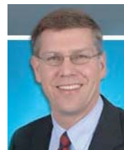
U.S. Congressman Erik Paulsen